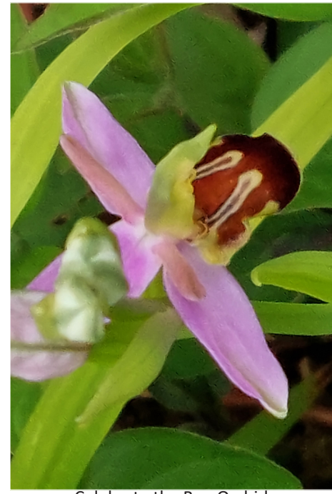
Celebrate the Bee Orchid

Please feel free to visit our banking at any time; there will be something to see or hear even in the deepest part of winter. It is a varied and beautiful