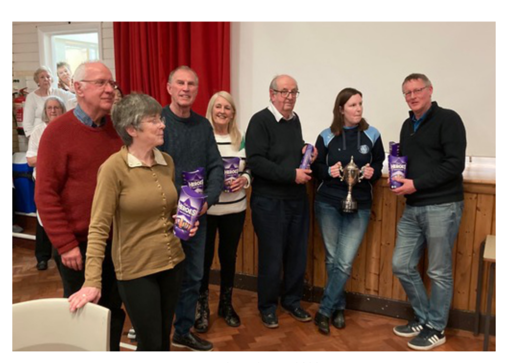
Potter Cup winners 2023 Seven Swans a-swimming