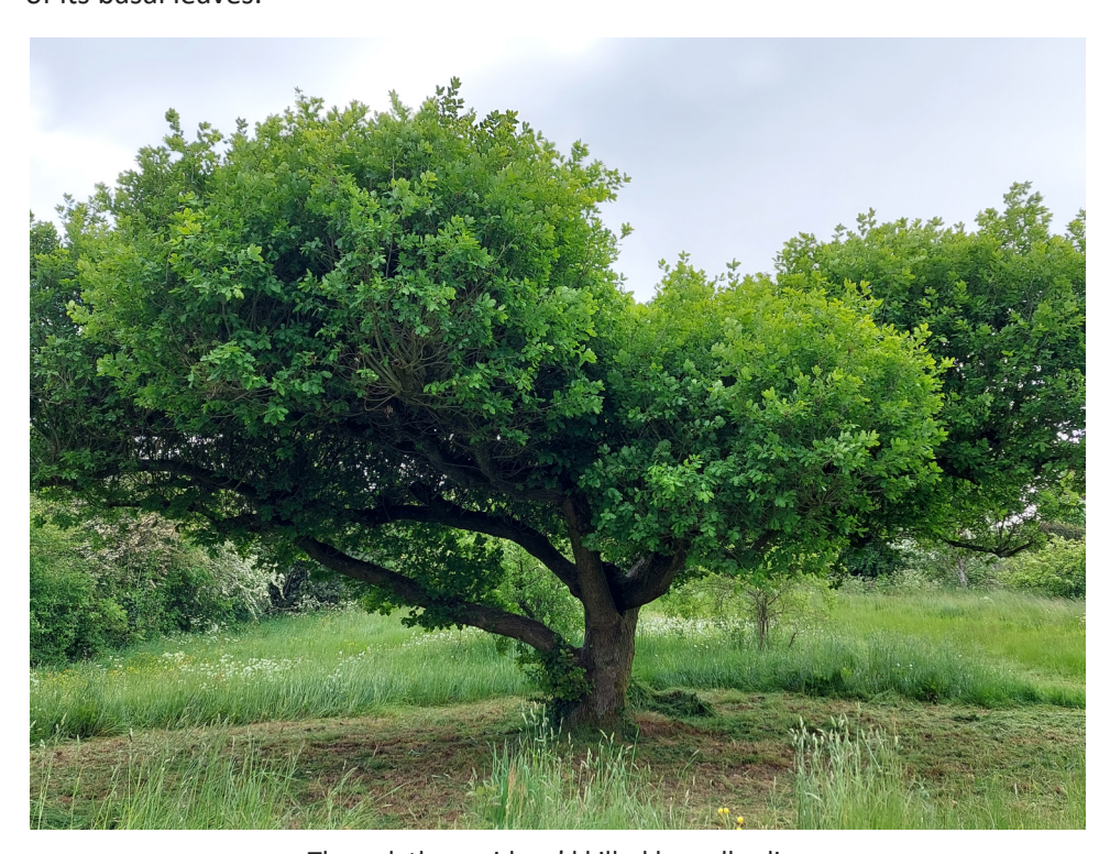
The oak they said we'd killed by pollarding

Hip Hip Hooray, and fingers crossed that they don't get eaten!