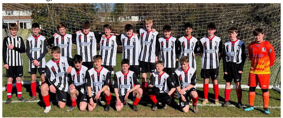
HVFC Under 16 League Winning side.

I am thrilled to announce that Socially Recruited have extended their