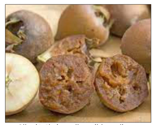
3lbs (1.4kg) medlars, (bletted) 1 green apple ½ Lemon 3 cups (600g) sugar

Medlars must be "bletted," which involves storing them in a single layer in a rather cool place, not the refrigerator, until they are soft and brown inside. They're ready when they are very soft and squishy to the touch.