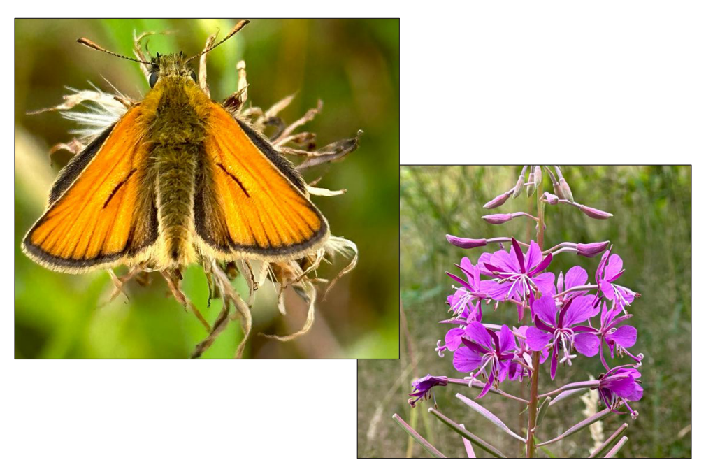
Small Skipper Butterfly; native. Rose Bay willowherb; invasive

*** Please don't let your dog fertilise the grass – it is contaminated and is only one of the reasons that our hay, after the grass has been cut, cannot be used as animal feed or put to any other farmyard/horticultural/ domestic or commercial use.