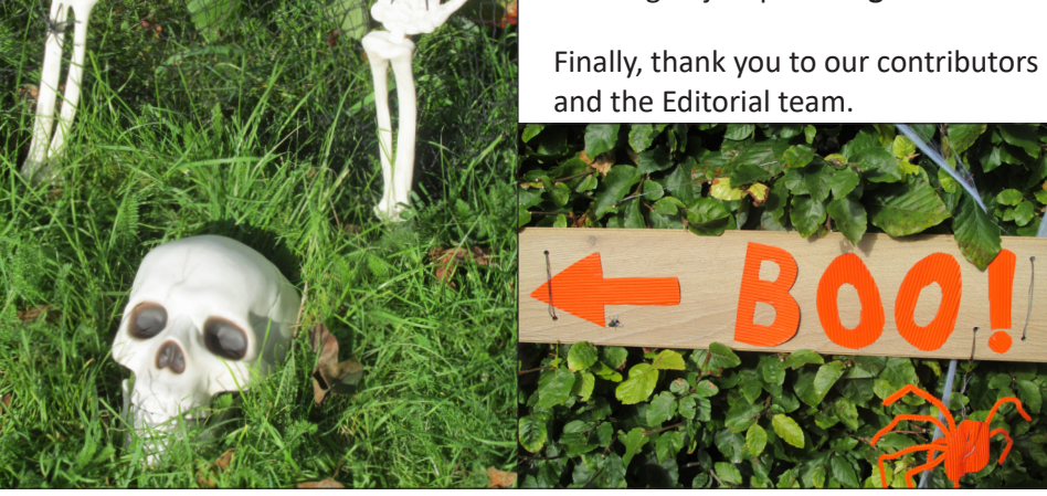
The editorial team as the deadline nears

Reader survey - Do you read the whole magazine, just parts, or just flick through? Please drop a line to magazine@hughendenresidents.org, or text to 07414 788182, no names needed, just say if you have read all the mag or just parts. Big Thanks.